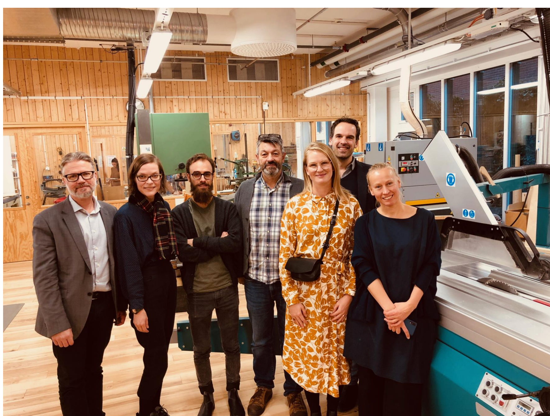
fig. 1 Project meeting at Chalmers Technical University, Nov. 2019